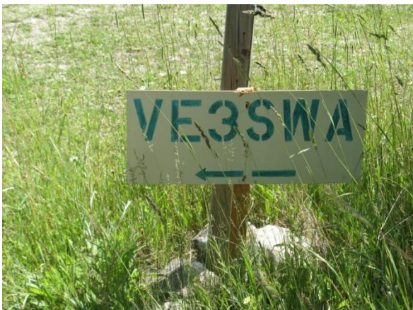
From a much drier year!

On a positive note, VE3SWA did take part in FD this year as well, just like we do in every year! Lessons have been learned and preparations have started for next year. There is always a 'next year' “